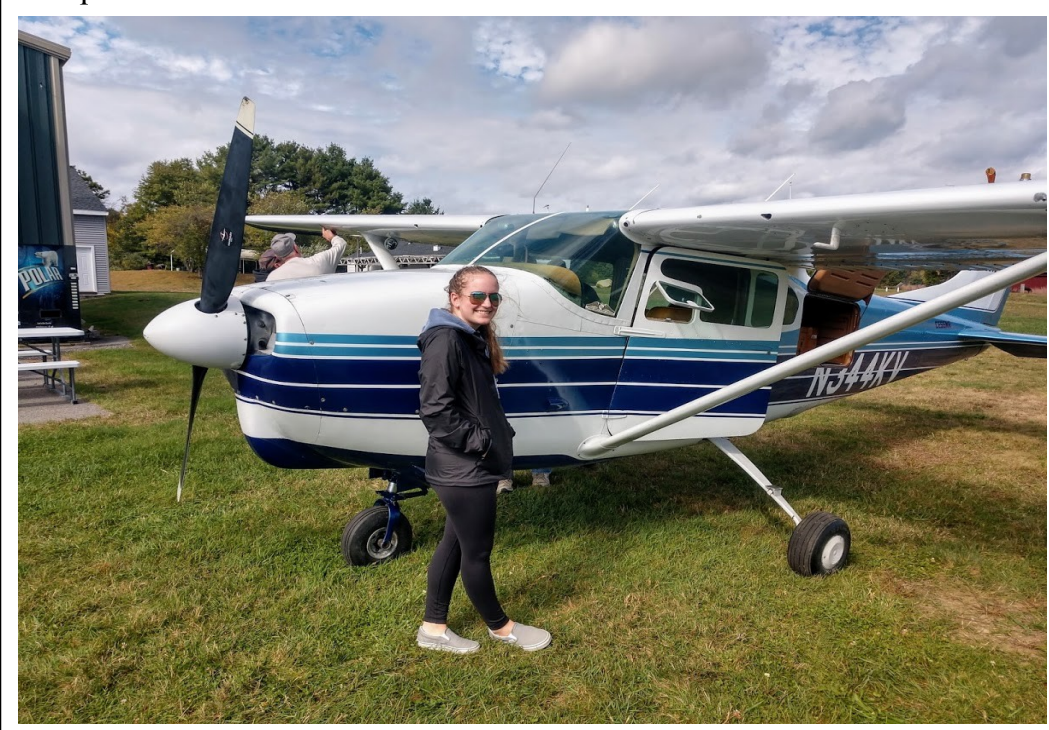
Your humble editor

I don't have much news, we had a great fly-in. I lieu of a bunch of words, here's a gratuitous pic of your humble editor's recently acquired 1960 Cessna 210.